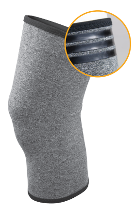
Tri-band technology holds sleeve securely in place and helps prevents rolling

A20149 (X-Small) A20150 (Small) A20151 (Medium) A20152 (Large) A20153 (X-Large)